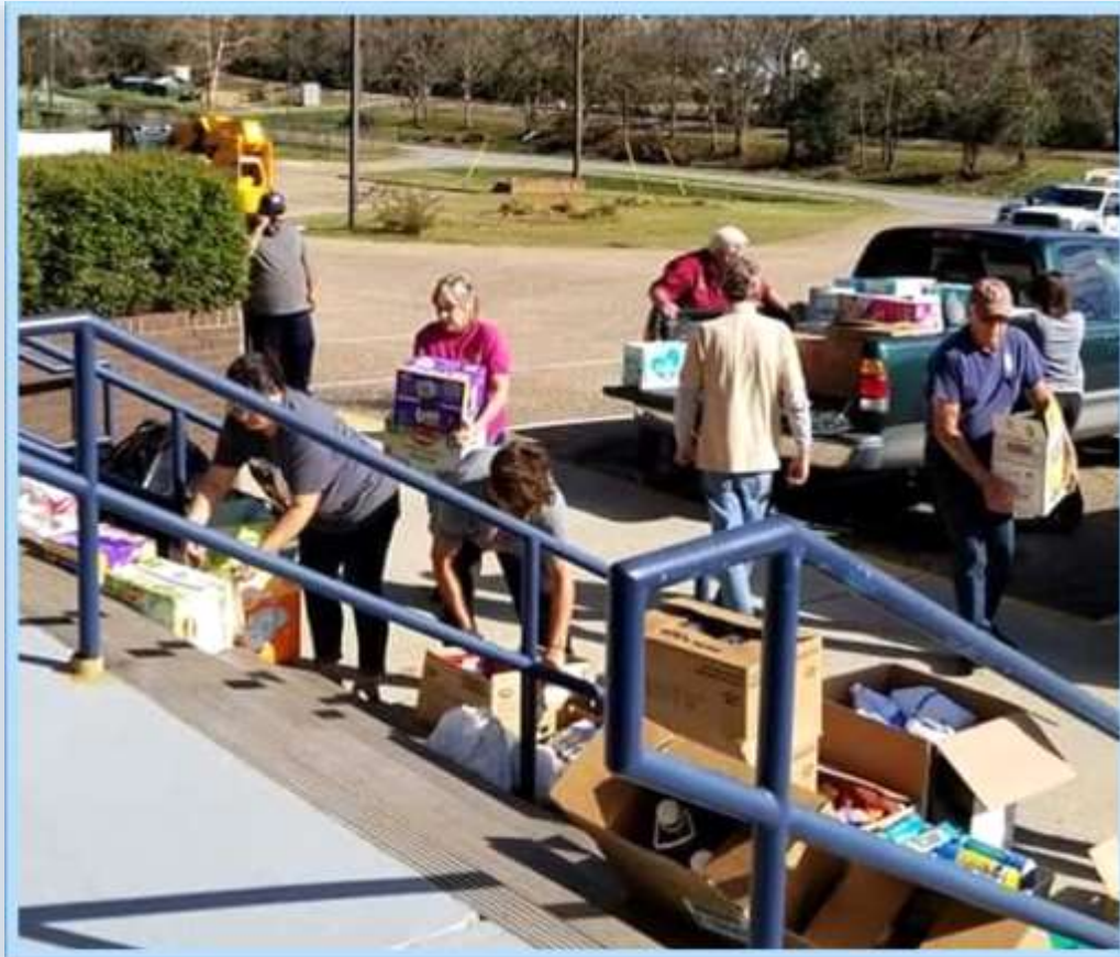
Unloading the supplies