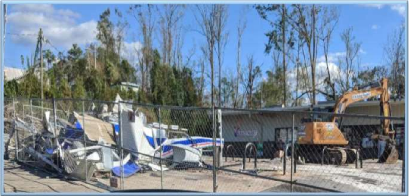
What we saw on the way