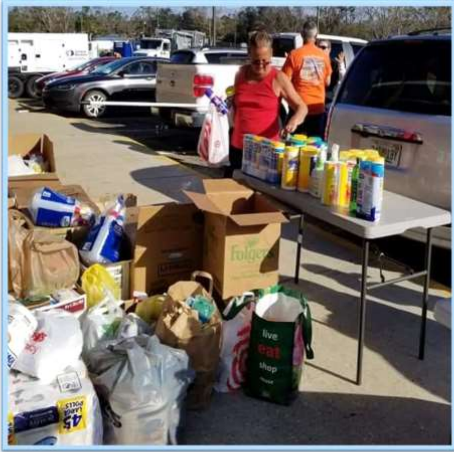
Residents receiving goods