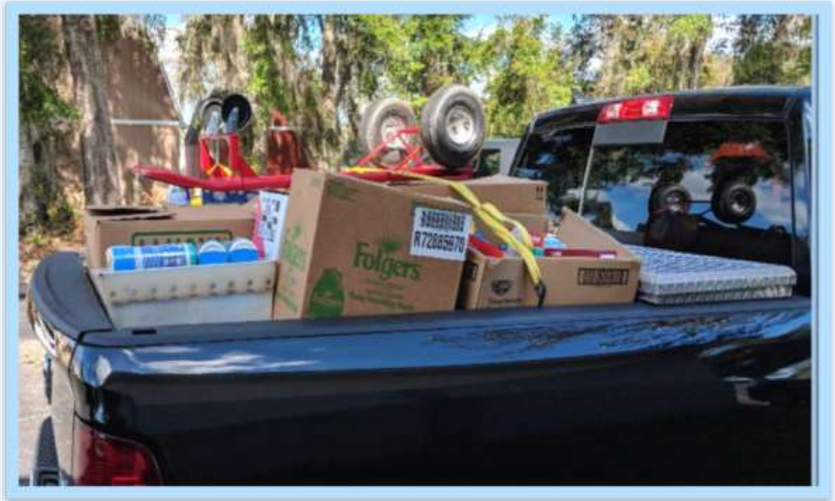
Headed to Sneads